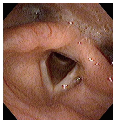
Fig. 1. Flexible laryngoscopic examination shows that both vocal cords were fixed in the lateral position during inspiration and expiration.

progressive weakness in both upper extremities with diminution of deep tendon reflexes. However, her respiratory status remained stable. A neurology consultation was requested. The neurologic evaluation did not uncover any signs of ophthalmoplegia, ptosis, or facial muscle weakness, but the gag reflex was absent. The muscle strength of both upper and lower extremities was 2/5 (muscle can move only if the resistance of gravity is removed).