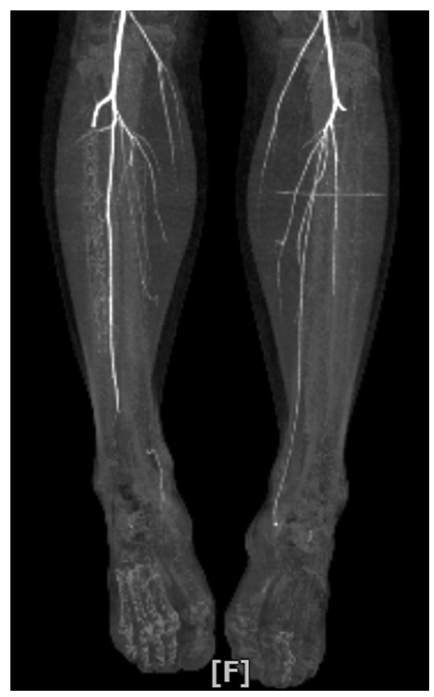
Fig. 2. Patient's CT angiography of lower extremities to assay the donor site bone and vessels.