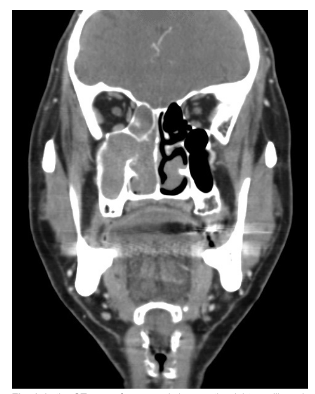
Fig. 1. In the CT scan of paranasal sinuses, the right maxillary sinus was filled with a heterogeneous soft tissue mass. The mass was extending into the nasal cavity with widening of the maxillary ostium.

2-month history of nasal obstruction and epistaxis. He had already been diagnosed as having chronic rhinosinusitis and nasal polyps, but there was no response to medical treatment. In the contrast computed tomography (CT) scan of his paranasal sinuses, there was a soft tissue mass that had completely filled the right maxillary sinus and was extending into the nasal cavity with widening of the maxillary ostium, the ethmoidal infundibulum, and lifting of the ethmomaxillary plate. This mass was diagnosed as inverted papilloma (Fig. 1). He underwent right endoscopic medial maxillectomy under general anesthesia and the diagnosis of inverted papilloma was confirmed by frozen biopsy. Intraoperatively, it was noted that the mass was penetrating into the anterior skull base and there was a 1.5-cm dural defect resulting in CSF leakage following the surgery. The defect was repaired using an underlay technique with the inferior turbinate mucosal flap, and the septal cartilage was sealed with a fibrin sealant Tissucol Duo Quick® (Baxter AG, Vienna, Austria). The lumbar drain was maintained for 3 days postoperatively. He was discharged from the hospital on the seventh day after surgery. During the followup period, 3 days before the visiting the emergency room, he complained of non-locaized mild headache and mild lethar-