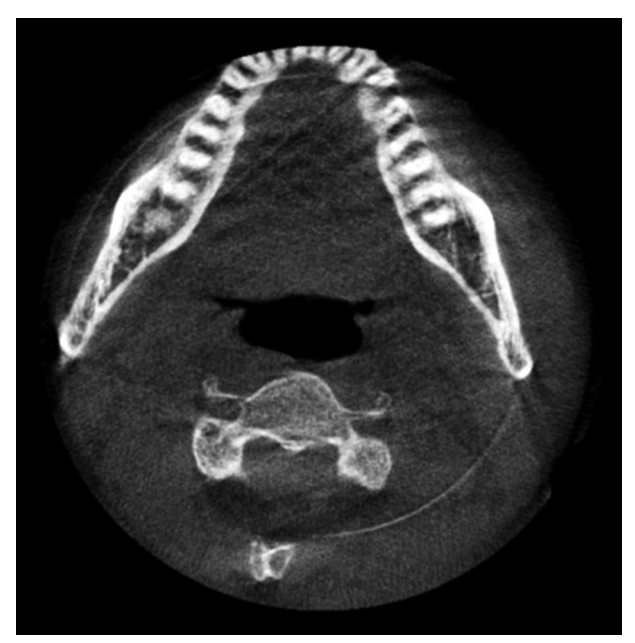
Fig. 3. Postoperative neck CT reveals reduction of tonsil size and disappearance of tonsillolith.

Clinically ST was defined by a positive history for TMJ and/ or head and neck dysfunction and/or a positive modulation of tinnitus following somatic maneuvers.<sup>1)</sup> There was a case in which tinnitus and ear pain occurred after abrasion of nasopharyx and modulated with forceful contraction of sternocleidomastoid muscle.<sup>7)</sup> In our case, the high-pitched hearing loss is different from the previous case, and we did not tested somatic modulation before surgery. It is the limitation of our study. But the tinnitus disappeared after treatment of GPN is believed to be related to somatosensory modulation. Comparison of previous studies on somatic modulation of tinnitus, the average prevalence of modulation was 69%. The main somatic regions resulting in tinnitus modulation were the TMJ and head and neck region, followed by the eyes and limbs.<sup>8)</sup>