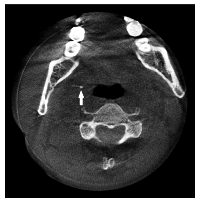
Fig. 2. Neck CT reveals a tiny radio-opaque tonsillolith (arrow) in right tonsil.

lations may occur immediately following stimuli such as forceful muscle contractions of the temporomandibular joint (TMJ), head and neck, and limbs.<sup>5)</sup> Animal studies have shown that projections from auditory nerve and trigeminal and dorsal column ganglia and brainstem nuclei integrates in the DCN.<sup>6)</sup> And according to the neurological model of somatic (craniocervical) tinnitus, sensory inputs from CST of cranial nerve VII, IX, and X converge to MSN, and the nerve fibers projecting from MSN to DCN can finally cause disinhibition of DCN, resulting in ST.<sup>4,6)</sup>