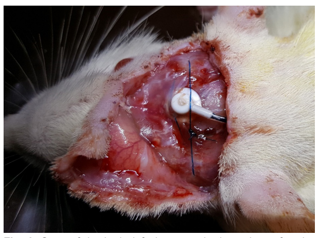
Fig. 2. State of the brain infusion cannula three days after the surgery. There was no displacement of the brain infusion cannula or cerebrospinal fluid leakage.

Although brain infusion cannula is a good method to deliver compounds directly into the brain, fixation of the brain infusion cannula is essential for successful delivery. Failure of fixation may cause not only failure of delivery of the compounds but also CSF leakage. Dental cements and adhesive gel are the commonly used materials for the fixation of infusion cannula. However, since these materials take time to harden, the cannula need to be kept dry during this time for successful fixation. Thus, these methods require not only additional time but also cost more. Moreover, fixation may fail occasionally. Consequently, we developed a novel method, which needs no additional materials. The fixation requires only the thread used for skin sutures. Furthermore, this method does not need a dry field and there is no need to wait until it hardens. Therefore, we think that this method will help in making experiments that use brain infusion cannula more convenient and faster.