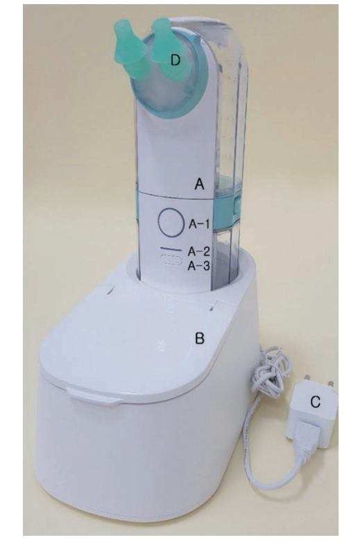
Fig. 1. Representative photograph of the NOSSHA® irrigation system (Womens Care Co., Ltd.; Seoul, Korea). The parts of the system are as follows: main body (A), power switch (A-1), intensity indicator (A-2), intensity control button (A-3), storage cradle (B), charger (C), and nozzle for the patient (D).

The ESS was performed under general anesthesia by a single surgeon in our hospital. All surgical procedures were performed using the standard technique for ESS, as previously